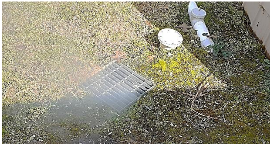
Stormwater smoke testing

Identifying and resolving leaks, defects and incorrectly installed stormwater connections all help to ensure a high-quality service to customers.