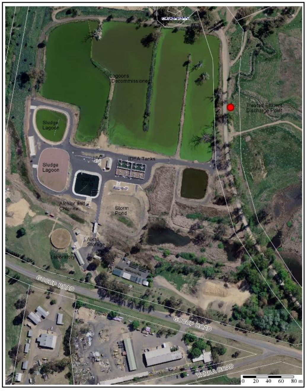
Figure 1: Tumut Wastewater Treatment Plant

The plans include a detailed map (or set of maps) showing the location of the premises, the surrounding area that is likely to be affected by a pollution incident, the location of potential pollutants on the premises, the location of any stormwater drains on the premises, and the discharge locations of the stormwater drains to the nearest watercourse or water body.