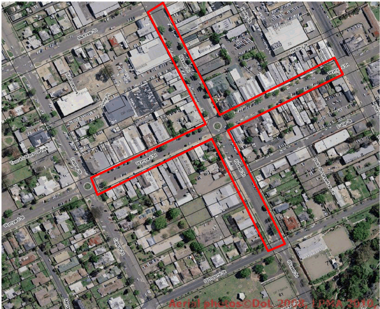
Figure 1 Tumut CBD main streets - Wynyard Street between Russell and Capper Streets, Russell Street between Richmond and Merivale Streets