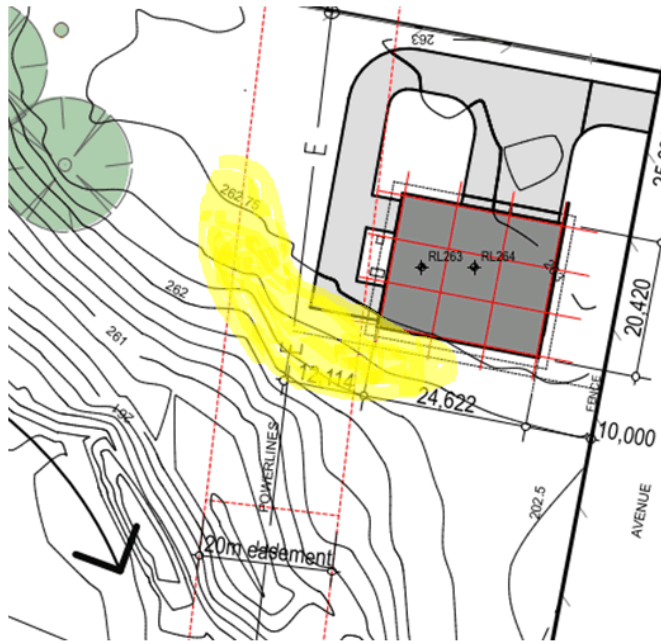
⇒ SLR Recommended area for sourcing fill to raise building floor levels – to mitigate any minor loss of floodway conveyance