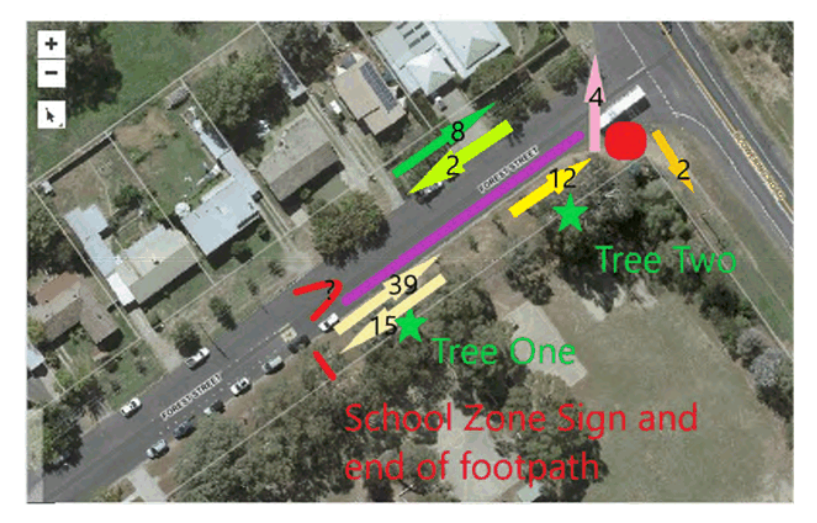
Pedestrian Movements along and from Forest Street northwest of Franklin Public School

The pedestrian movements observed for the first afternoon dismissal of term 4 outside Franklin School are recorded below.