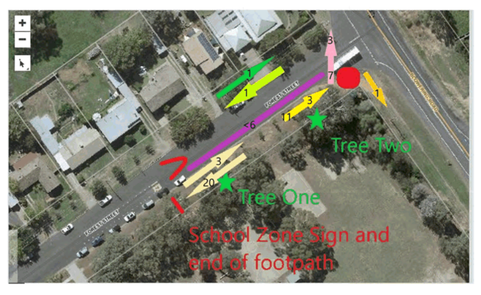
Pedestrian Movements along and from Forest Street northwest of Franklin Public School

The pedestrian movements observed for the second afternoon dismissal of term 4 outside Franklin School are recorded below.