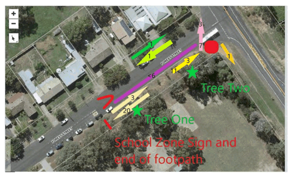
Pedestrian Movements along and from Forest Street northwest of Franklin Public School

The pedestrian movements observed for the second morning arrival of term 4 outside Franklin School are recorded below.