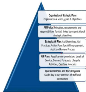
Figure 1 - Hierarchy of Objectives

The AMS is comprised of a set of inter-related documents that 'cascade' outwards with increasing detail and complexity, but remain anchored in Council's adopted policies and strategic direction.