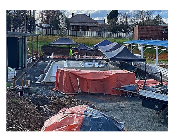
The marquees were multiplying at the Tumut Pool recently to keep stage 2 upgrades progressing despite the rain

The weather is also impacting the delivery of key projects and teams are coming up with clever and initiative ways to keep works moving forward.