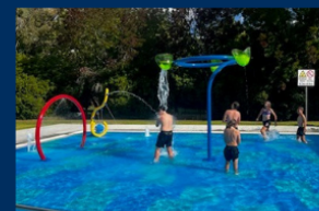
Batlow Pool Upgrades – new learn to swim and splash play area and new amenities. Completed May 2023

Here's just an example of some of the capital projects Council has delivered over the past 12 months.