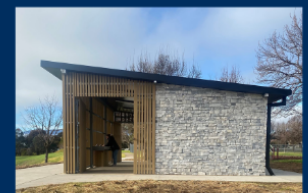
New amenities at the popular Bull Paddock Youth Precinct Completed August 2022