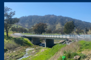
Bombowlee Road and Bridge upgrade. Completed July 2022