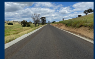
Upgrade of 1.56km of Yaven Creek Road adjacent to Snowy Mountains Highway. Completed December 2022