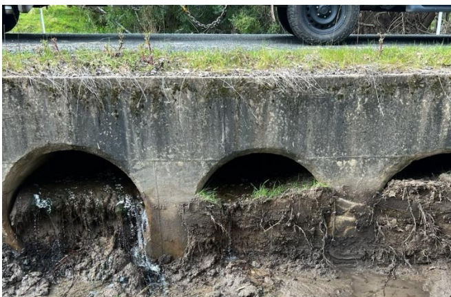
A blocked culvert on Goobarragandra Rd that was cleared this week.

Ensuring our culverts are kept clear helps to prevent road flooding events and allows the natural flow of water under road crossings.