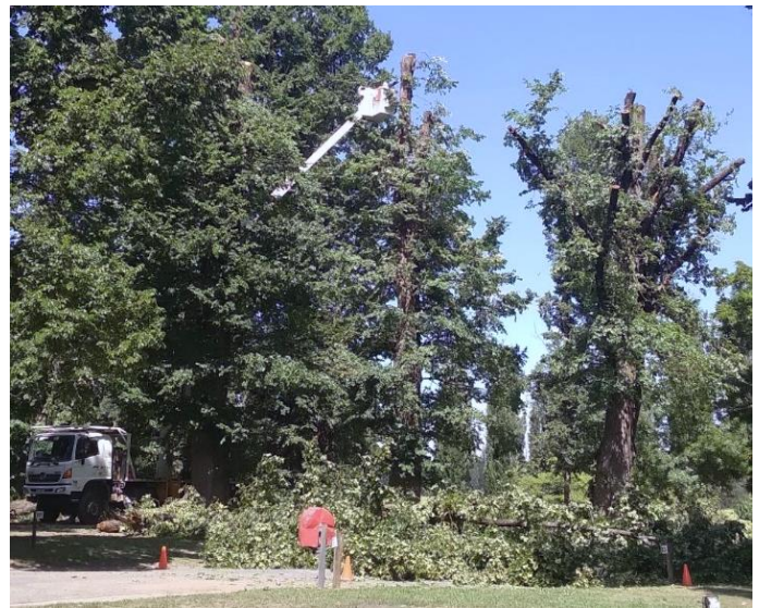
Tree pruning at Riverglade Caravan Park (pictured)