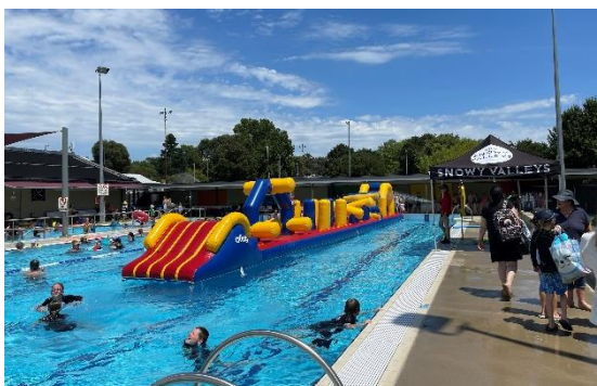
Funded through the Regional Youth Holiday Break Program - Our Regional NSW.