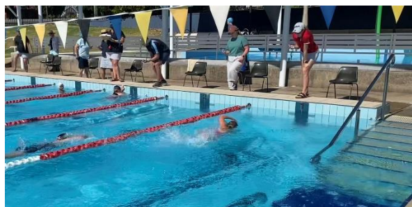
The Tumbarumba Pool will soon have an access ramp like this one at the Tumut pool.

These upcoming works are funded through the Federal Government’s Local Roads and Community Infrastructure program and should be concluded prior to the next pool season.