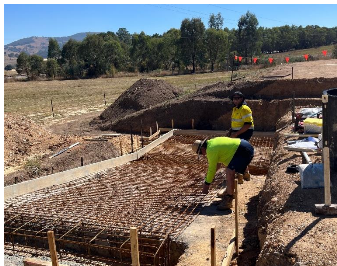
Above: Concrete box works for GPT. The GPT is designed to capture debris and pollutants before they enter the compost run-off dam.

Next up we’ll be building the storage shed, installing the required weather station, and assembling the Modular Aerated Floor (MAF) Composting system.