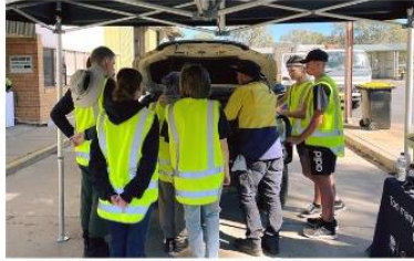
Youth Week Basic Car Skills Workshop