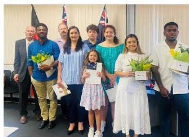
18 new Aust Citizens welcomed