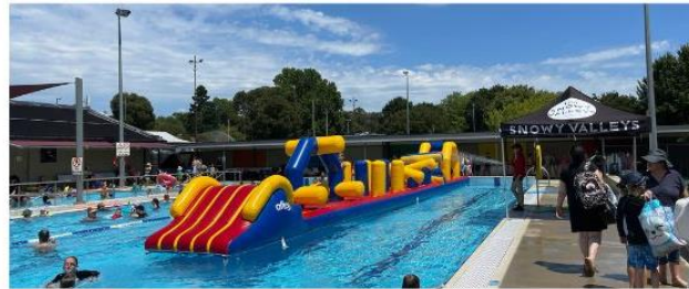
Summer Pool Parties with free entry, giant inflatables, and food