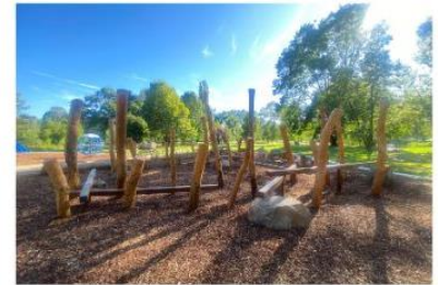
Upgrades and new amenities for Tumut Rotary Pioneer Park