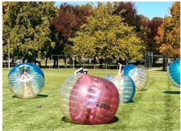
School Holiday Bubble Games