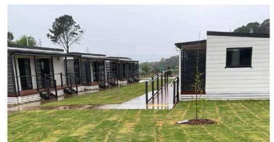
New worker accommodation at the Batlow Caravan Park officially opened