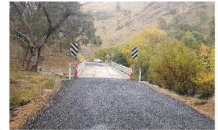
Replacement of Brungle Creek Bridge # 3