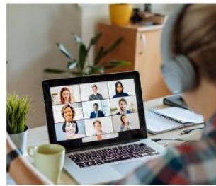
Small Business Month Webinars