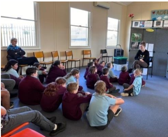
Above: Adelong Public School students in their "Garbage to Garden" workshop.

This program was funded by the Canberra Region Joint Organisation, of which SVC is a member.