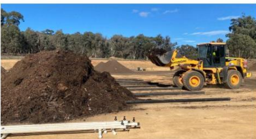
Organics processing at the new Gilmore Processing Facility