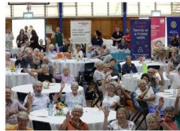
Seniors Festival Expo Days