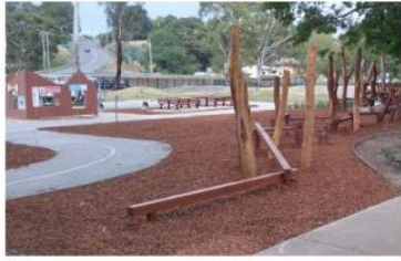
Upgrades and new amenities for Tumbarumba Goldfields Park