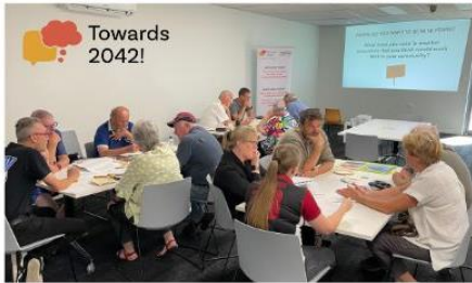
Engagement sessions reviewing the Towards 2042! Community Strategic Plan