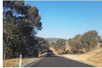
Rehabilitation Works on Yaven Creek Rd