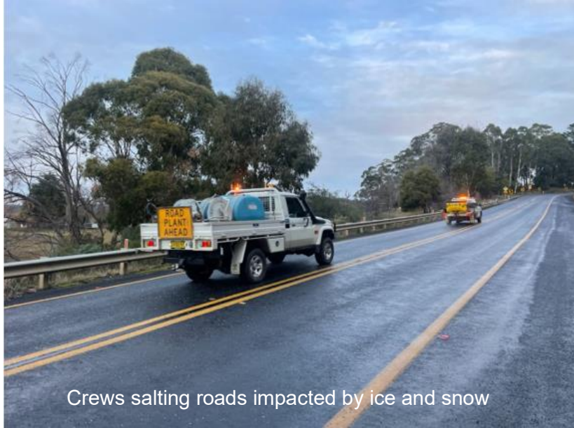
Crews salting roads impacted by ice and snow