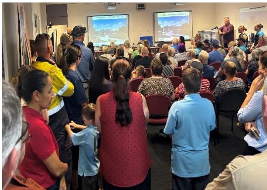
Community members at the 4pm Concept Design Session on Tuesday.

https://yourvoice.svc.nsw.gov.au/multipurpose-centre