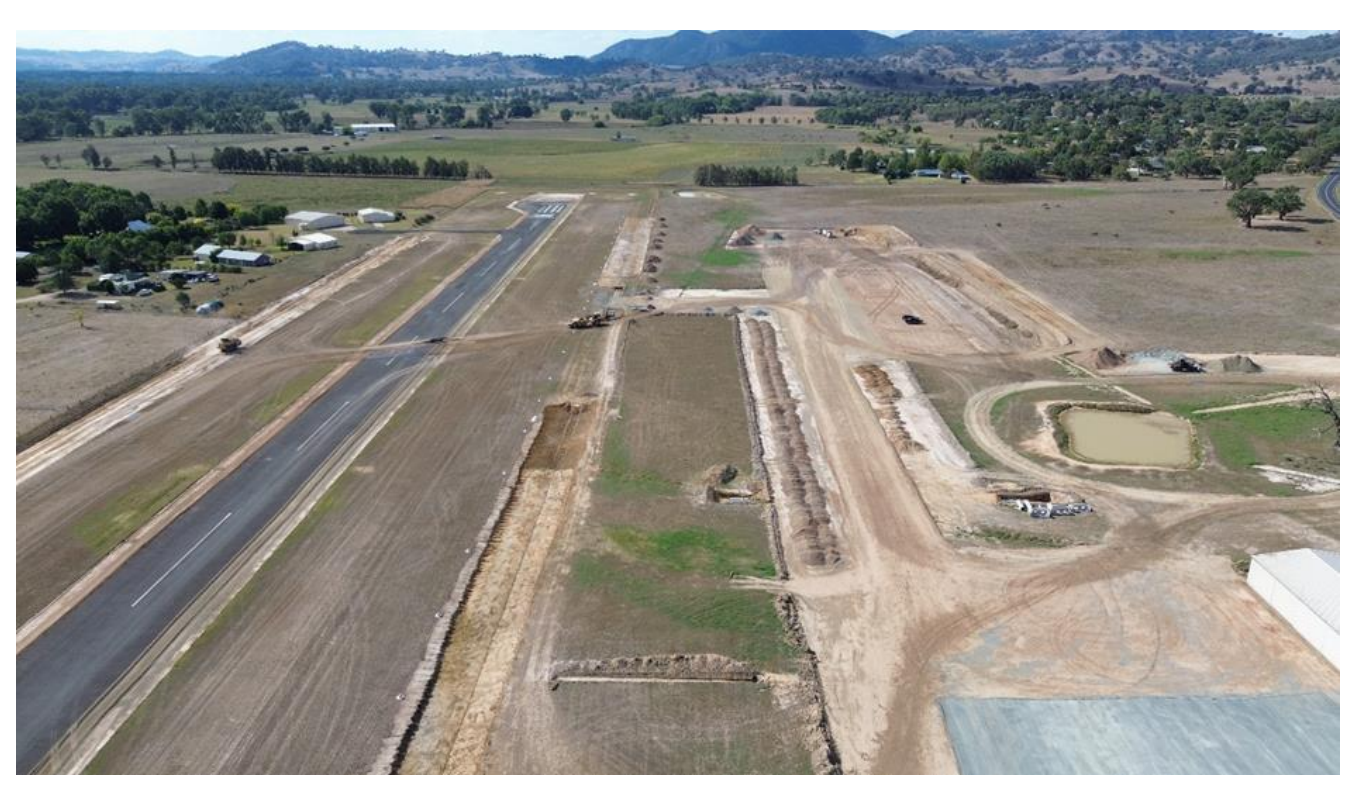
Aerial Photo of works - March 2025