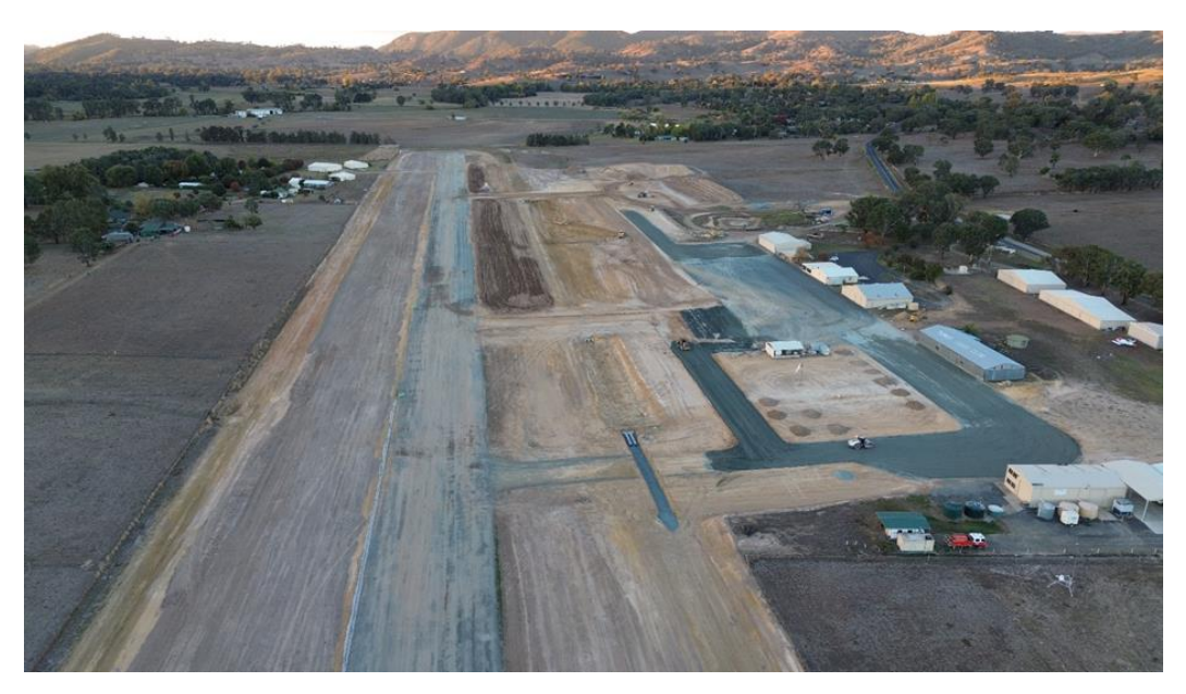
Aerial Photo of works - April 2025