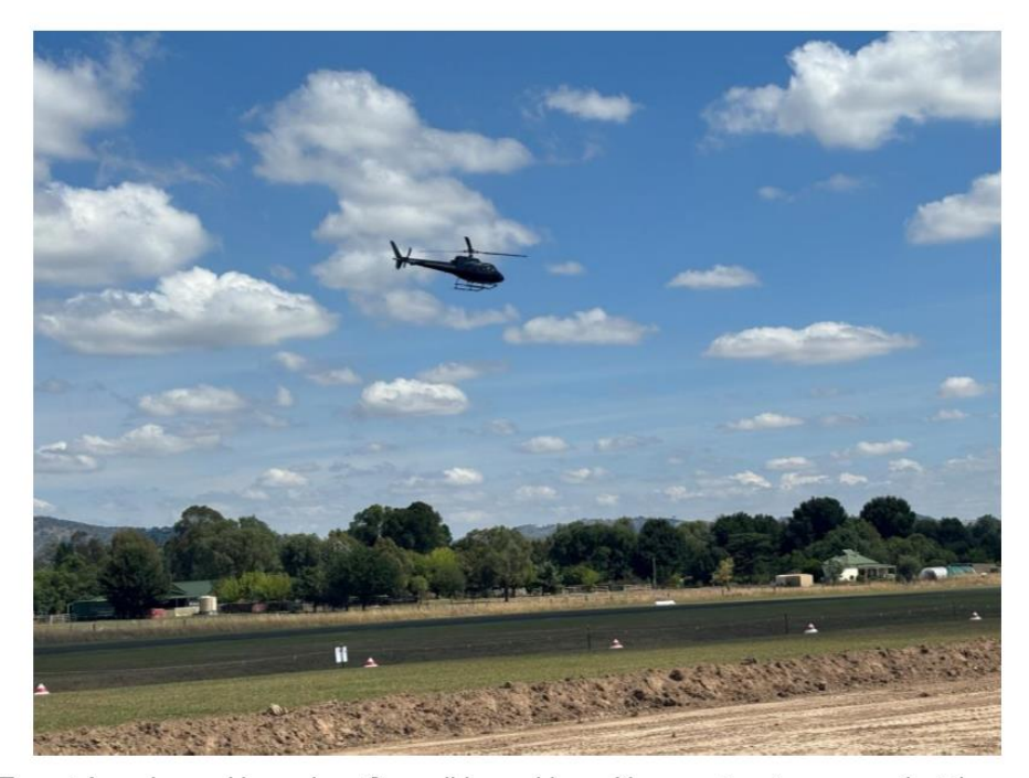
Photo 7 - Tumut Aerodrome Upgrade – Council is working with operators to ensure that the aerodrome remains operational while the works are progressing - 11 February 2025