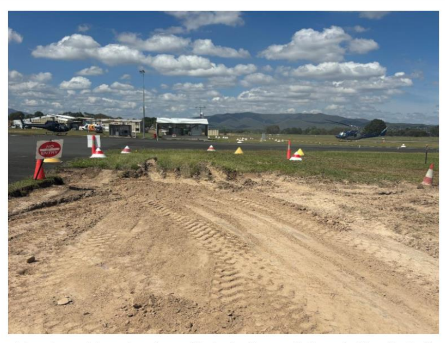
Photo 4 - Tumut Aerodrome Upgrade – Apron Works looking south towards True North Operations - 11 February 2025