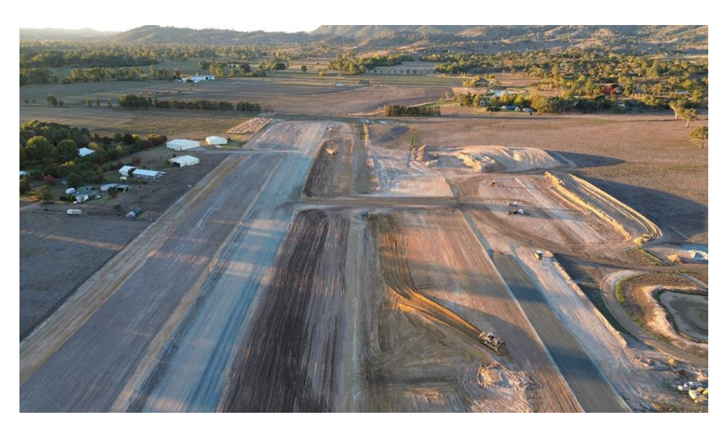
Aerial Photo of works - April 2025