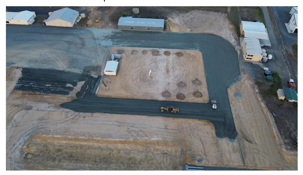
Aerial Photo of works – April 2025