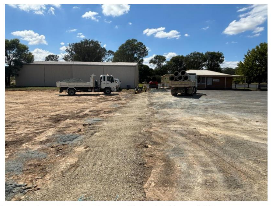
Photo 6 - Tumut Aerodrome Upgrade - Drainage Works - 11 February 2025