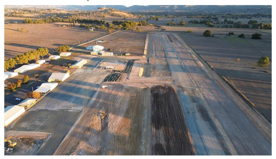
Aerial Photo of works - April 2025