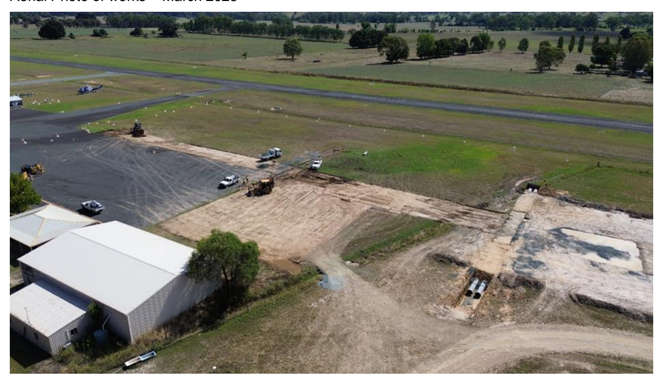
Aerial Photo of works - March 2025