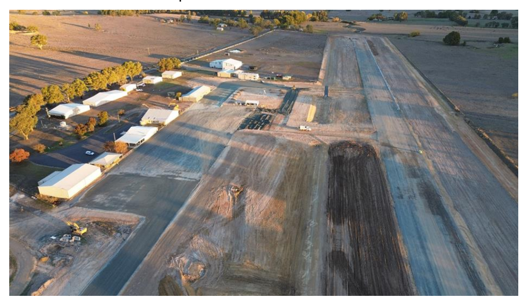
Aerial Photo of works - April 2025