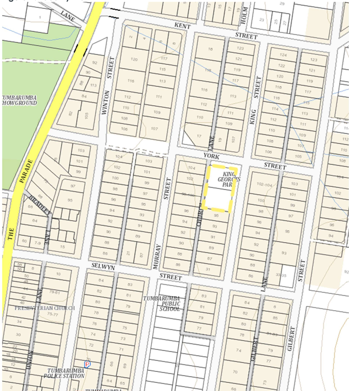
Figure 2: Locality Plan