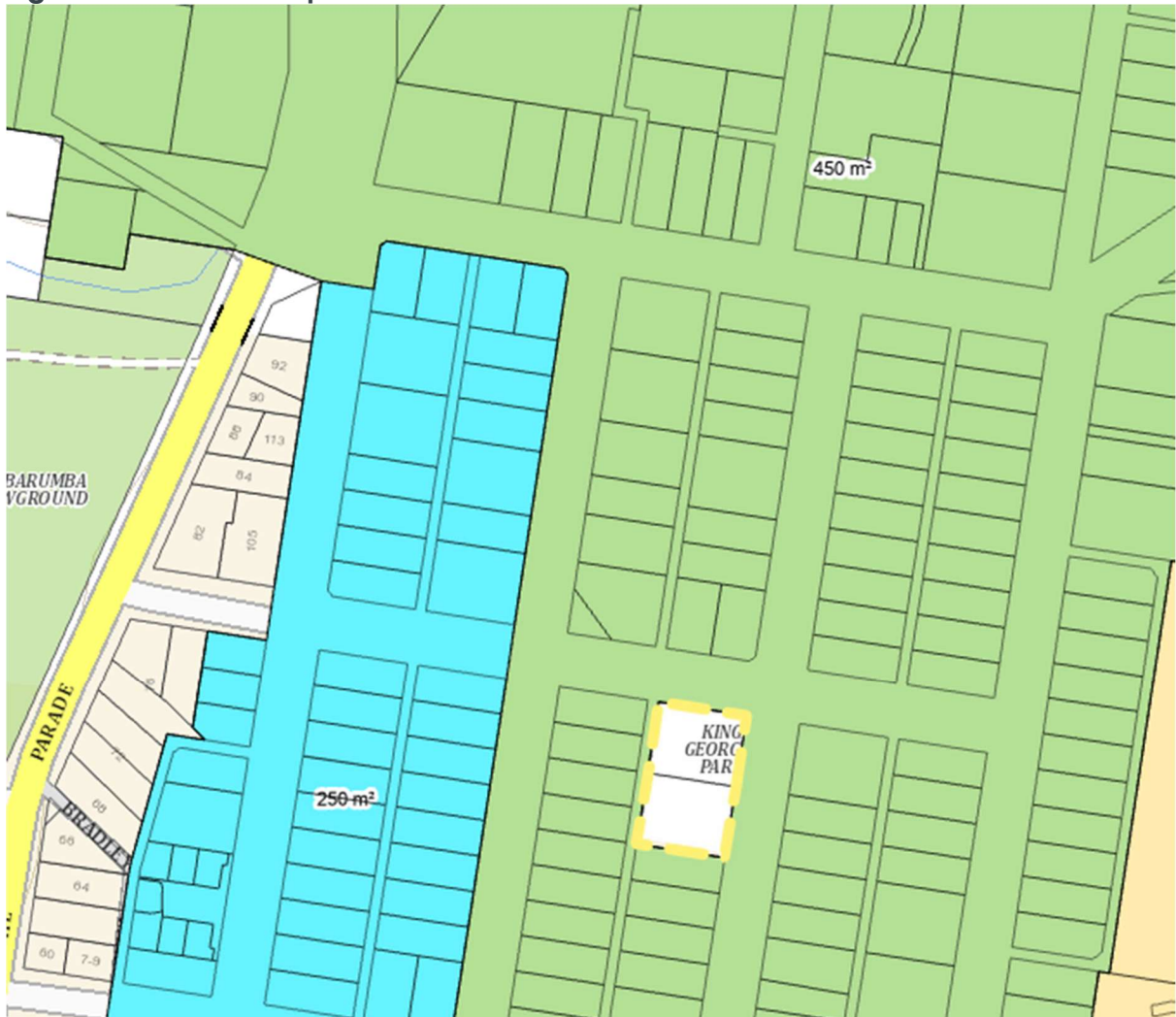
Figure 5: LEP - MLS Map