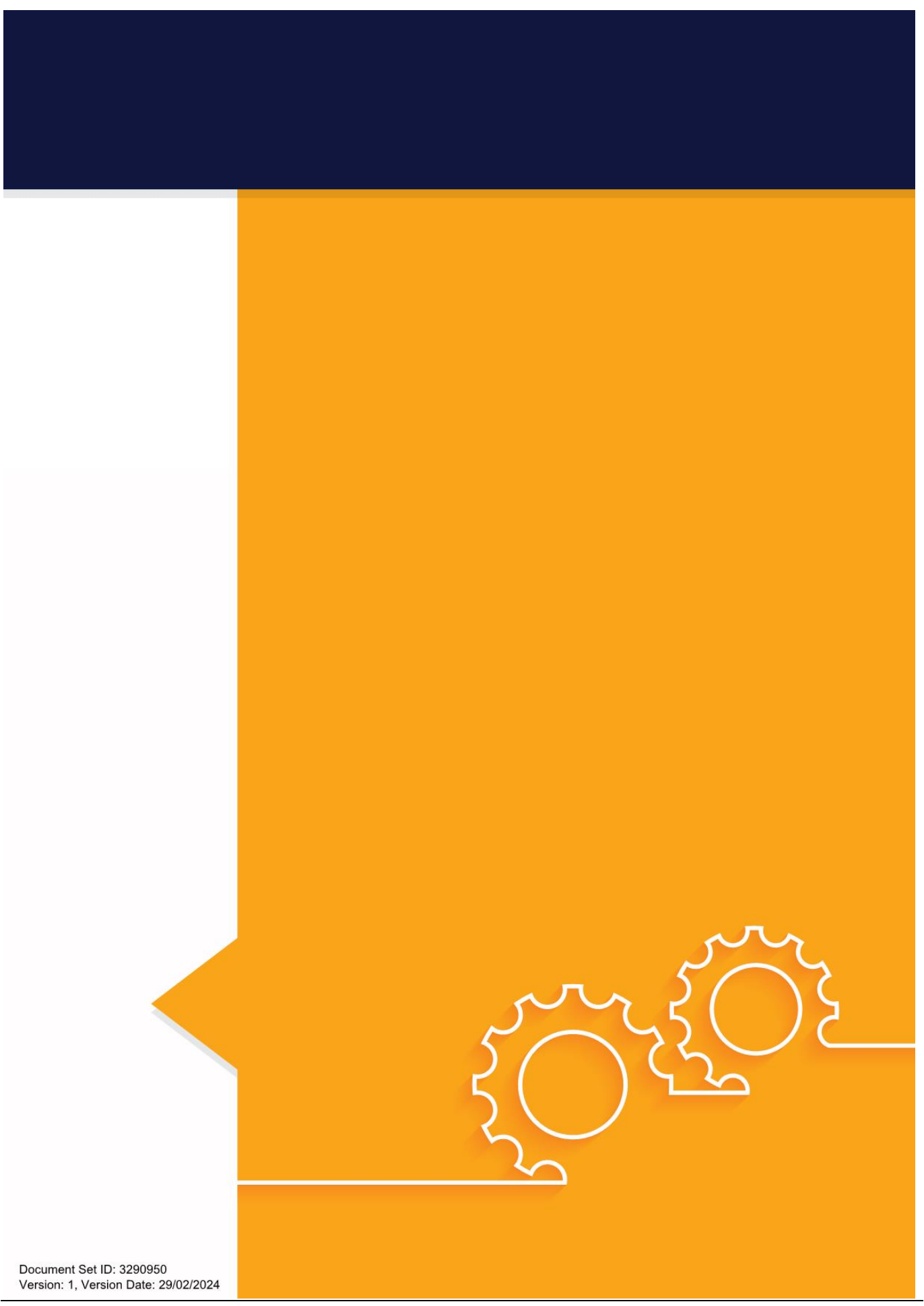
10.3. AUSTRALIAN LOCAL GOVERNMENT ASSOCATION 2024 NATIONAL GENERAL ASSEMBLY 2-4 JULY - ATTACHMENT Page 40