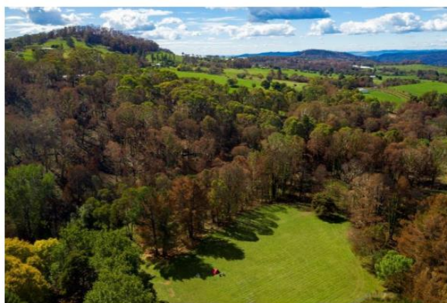
Figure 1. Location Plan